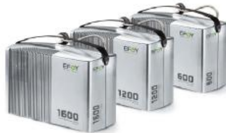
New: EFOY Fuel Cell Systems

More at www.udomi.de/products/fuelcellsystems-e.html