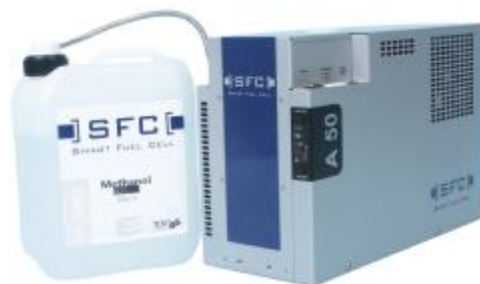
Proven and reliable SFC A50 Fuel Cell System

Please find more informations at www.udomi.de/home/home-e.html